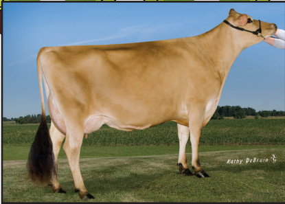
JX PINE-TREE WORLD CUP DELLIA {5}-ET Dam of Lot 4