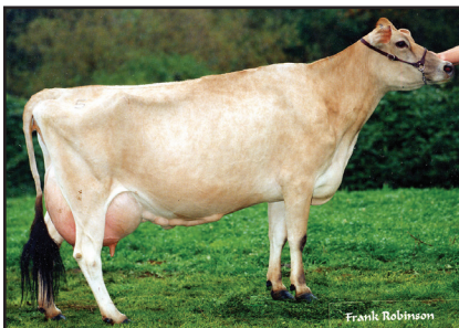
TENN HAUG E MAID, E-93% Seventh Dam of Lot 4