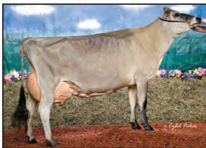
PLEASANT NOOK SAMBO TEAL