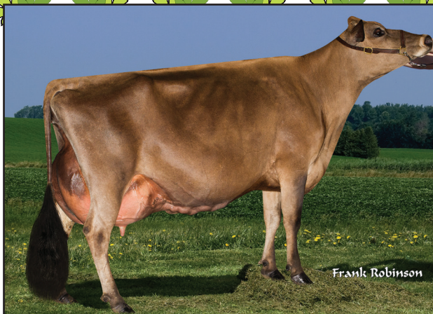
KKF COLOR TEQUILA CORDIE, E-92% Great-Grandam of Lot 12