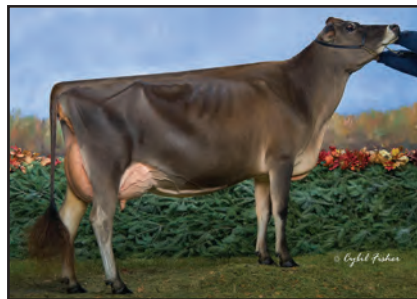
TOWER VUE TOBAGO-ET