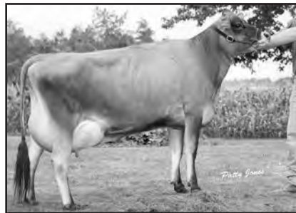
OHIO BARBER BERRETTA MILFRED GP 80 (CAN) 1-10 305 20,820 3.1% 649 3.4% 715

To date, the sale has continued at the Ohio State Fairgrounds in conjunction with the Spring Dairy Expo. In recent years, the Buckeye Dairy Club has worked with state breed associations to host Holstein, Guernsey, Ayrshire and Milking Shorthorn sales. The Buckeye Dairy Club is excited to continue to include Jerseys with help from Jersey Marketing Service.