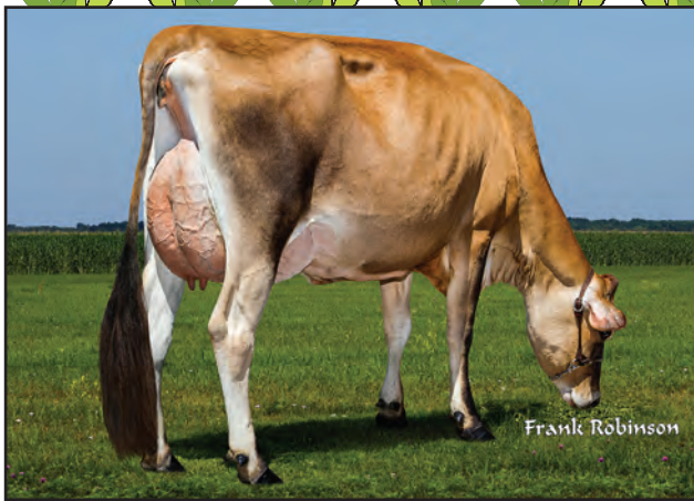
AHLEM TITAN VANITY 1245, E-93% Sister to the Grandam of Lot 1