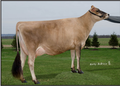
JX PINE TREE AVON DELLA {3}-ET Sister to the Dam of Lot 4