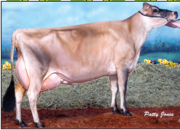
HURONIA SD NATASHA 1P, SUP-EX 92-6E (CAN) Fifth Dam of Lot 9