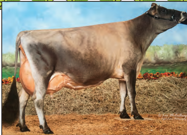
JUSTICES ZOEY, VG-88% Grandam of Lot 22