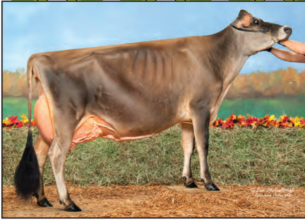
MARHAVEN MINISTER CORONA-ET, E-94% Sister to the Grandam of Lot 13