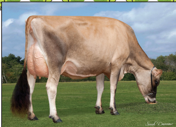
CLARESHOE ALLSTAR ZOOM ZOOM, E-91% From the Same Family as Lot 20