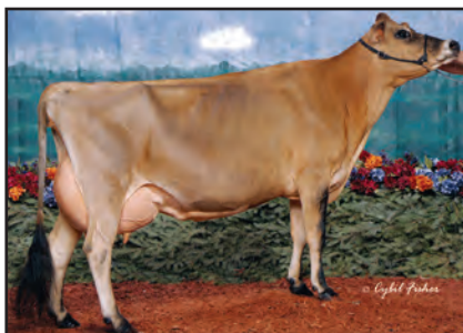
TOWER VUE TERROR