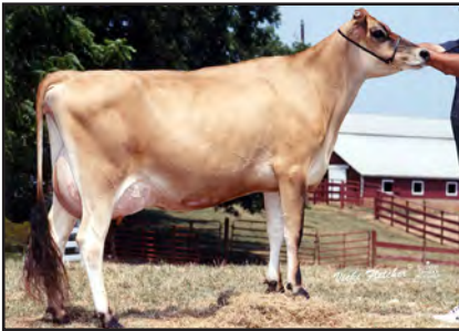
WILLIAMS IMPRESSIVE IDEA-ET, E-90% 3-5 305 20,096 4.7% 950 3.6% 715 Reserve Intermediate Champion, 2000 All American Jersey Show

One of the ‘landmark’ activities of the Buckeye Dairy Club has been the dairy cattle sale. The first sale was held in the Plumb Hall arena on May 16, 1981 and was titled “Buckeye Classic Calf and Heifer Sale” with only Holstein cattle being sold. There were 41 lots sold the first year. The Club received the College’s New Activity Award for the sale for the 1982-1983 academic year. By 1988, the title had become the Buckeye Classic Sale, it also included lactating Holstein cows, and it was moved to the Ohio State Fairgrounds.