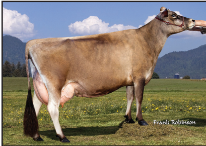
SUNSET CANYON IMPULS L MAID 4-ET, E-93% Sixth Dam of Lot 4