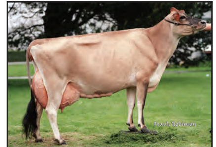
SUNSET CANYON MBSB ANTHEM-ET, E-95% Fifth Dam of Lot 15

SIRE: GRIFFENS GOVERNOR-ET GJPI -50 4%ILE SISTER(S): SUNST CANYON ACTION FP ANTHEM 91% 1-10 305 2 15200 4.4 669 3.6 548 96DCR 1830C