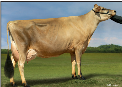
OAKLANE CHISEL DELLA 2130-ET Grandam of Lot 4