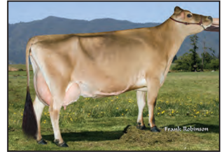
SUNSET CANYON F PRIZET ANTHEM-ET Great-Grandam of Lot 15

SUNSET CANYON MERCHANTS I MAID-ET EX 90-2E (CAN) USA 117763650 GT50K BBR 100 JH1C TATTOO / C84 1-08 305 2 14979 5.9 886 3.9 584 CAN 2022C 3-01 305 2 17241 5.8 1008 4.0 697 CAN 2414C 4-06 305 2 17812 5.9 1050 4.0 714 CAN 2473C 5-06 305 2 18010 6.4 1144 4.3 774 CAN 2863C CDCB GPTA S 02/04/2020 ORECS 86%R 69%ILE 96M 0.28% 60F 0.08% 20P 292CM$ 266NM$ 208FM$ 0.6PL -2.6LIV -3.7DPR -3.6CCR -0.9HCR 3.09SCS 155GMS AJCA 02/04/2020 GPTAT 84%R 1.2 GJUI 10.2 GJPI 83%R 65