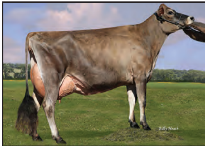
JEMI PREMIER TRIUMPH-ET