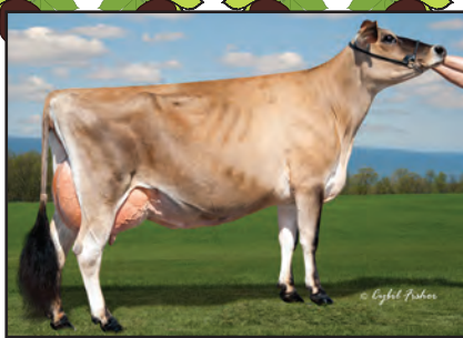
TOWER-VUE JM COMERICA THUMPER-ET