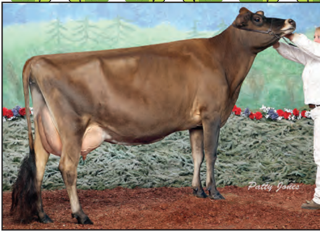
POTWELL WHISTLERS EMILY, EX 92 (CAN) Fourth Dam of Lot 5