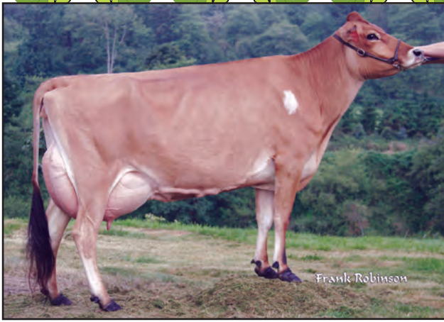
SUNSET CANYON THUNDER ANTHEM 3-ET, E-93% Fourth Dam of Lot 15