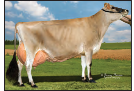
SUNSET CANYON GG FP ANTHEM Grandam of Lot 15

ALL LYNNS VINNIE-ET USA 117765133 GT50K BBR 100 JH1F 200JE207 CDCB GPTA S 12/01/2019 222DAUS 125HRDS 4%RIP 95%R 680M 0.16% 66F 46%ILE 95%R 0.08% 41P 411CM$ 380NM$ 311FM$ 239GMS 0.6PL 1.1LIV -3.7DPR -4.8CCR -1.8HCR 3.10SCS AJCA 12/01/2019 128DAUS GPTAT 91%R 0.9 GJUI 3.0 GJPI 92%R 99