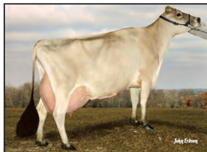
WELDY BLAIR TASHA, E-91% 5-2 305 21,860 5.7% 1238 3.7% 813

The Jersey portion of the sale has a rich history with many great cows selling through the years, including the four cows to the left. Williams Impressive Idea was not only the Reserve Intermediate Champion of the All American Jersey Show, but she is the dam of SC Golddust Paramount latola, the ONLY five-time Premier Sire of the All American Jersey Show in breed history. Many other great ones have also sold and represented the herds of our distinguished alumni and friends well.