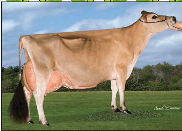
AHLEM CELEBRITY RUTH 34728, E-95% Grandam of Lot 11