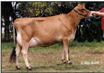
WF/L&M FRANCO BENNI, E-90% 2-1 305 15,480 3.8% 590 3.7% 575 2nd Two-Year-Old, 1998 Ohio State Fair

One of the ‘landmark’ activities of the Buckeye Dairy Club has been the dairy cattle sale. The first sale was held in the Plumb Hall arena on May 16, 1981 and was titled “Buckeye Classic Calf and Heifer Sale” with only Holstein cattle being sold. There were 41 lots sold the first year. The Club received the College’s New Activity Award for the sale for the 1982-1983 academic year. By 1988, the title had become the Buckeye Classic Sale, it also included lactating Holstein cows, and it was moved to the Ohio State Fairgrounds.